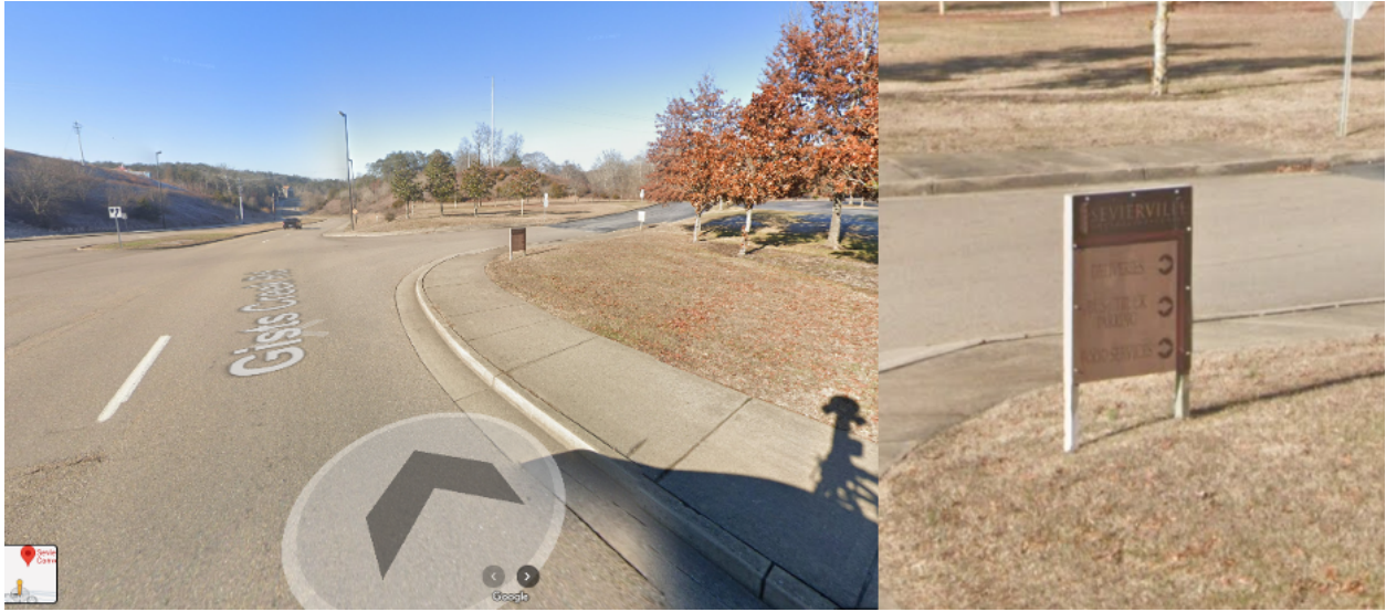
Figure 1: Vendor/Staff Entrance